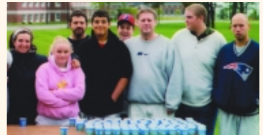
The boys & girls prepare to work at a "water stop" for the Pineland Foliage Race.

"Volunteering in our communities is an integral part of the Farm's program. At their best, service-learning experiences are reciprocally beneficial for both the community and students. For students, it is an opportunity to develop life skills; enhance personal